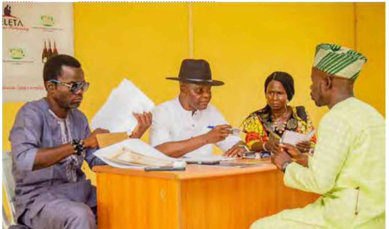
A councilorship aspirant in Badagry West LCDA undergoing screening